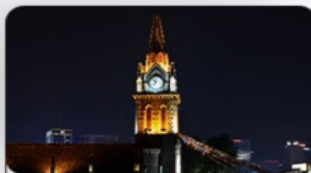
Focal length : 2.8MM Angle of view : 114.6°