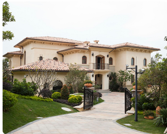
Access to the compound