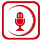
Built in Microphone