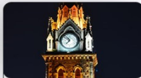
Focal length : 6MM Angle of view : 54.4°