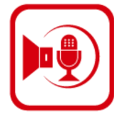
Two Way Audio