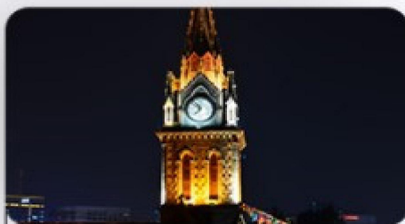
Focal length : 4MM Angle of view : 86.2°