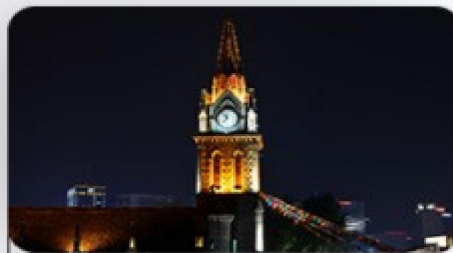
Focal length : 2.8MM Angle of view : 114.6°