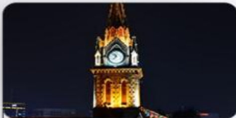
Focal length : 4MM Angle of view : 86.2°