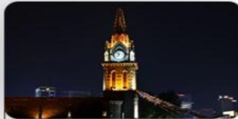
Focal length : 2.8MM Angle of view : 114.6°