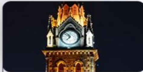
Focal length : 6MM Angle of view : 54.4°